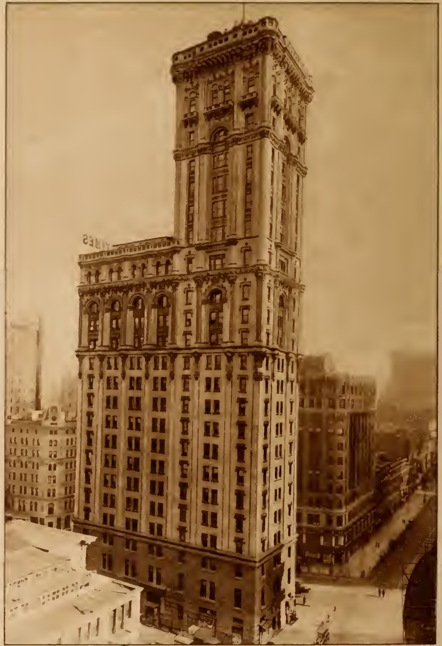
NEW YORK TIMES BUILDING, Broadway and 42nd Street, in the heart of the theatre district, owned by the New York Times, one of the Metropolitan Dailies.